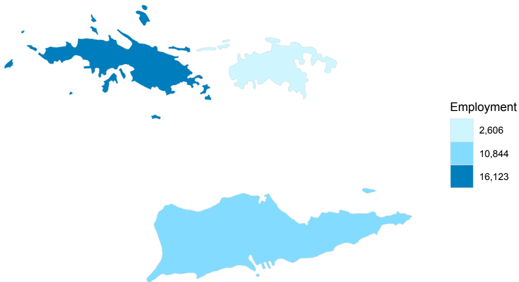
Figure 3: US Virgin Islands Employment by Municipality, 2016.